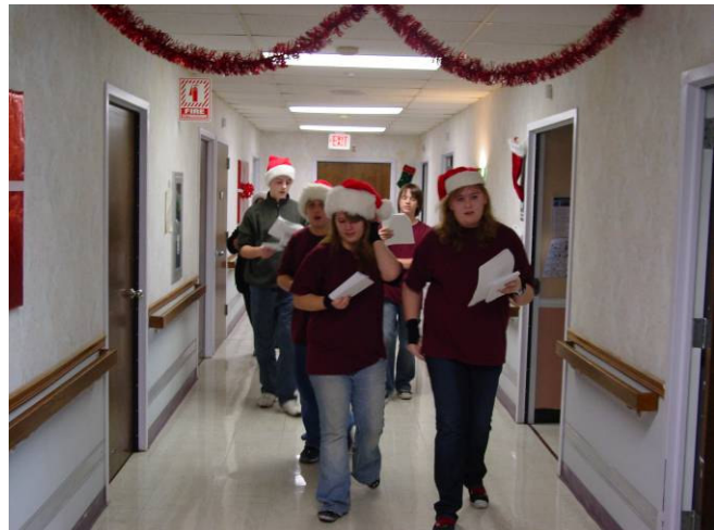
Leo Club members carol in the hallways of Tower Hill Nursing home.